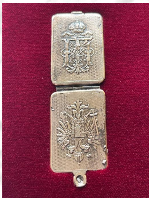
24. Memorial sign of the Hoffmann Corps, in the 129th and 130th brigades of which Ukrainian Sich Riflemen fought.